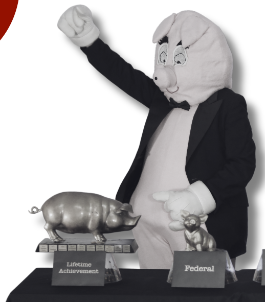
2022 Teddy Awards